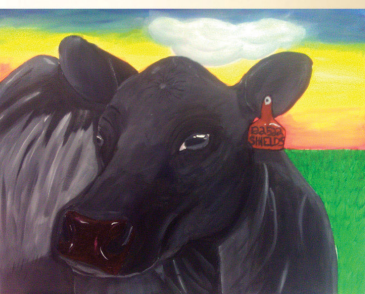
Shields Angus View